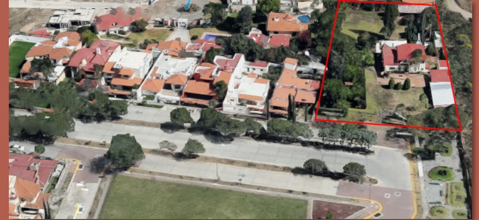
Aerial views of the property